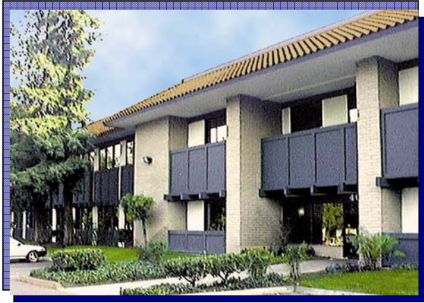
4030 Moorpark Avenue, San Jose